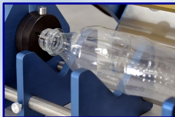
Universal finish support