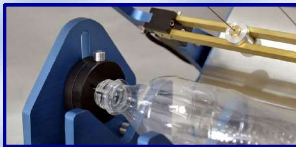
Universal finish support